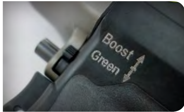
Eco Touch system